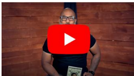
Danny Dollar's Guide to Financial Awesomeness | #3 Saving