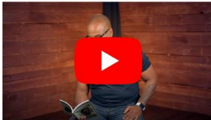
Danny Dollar's Guide to Financial Awesomeness | #1 Intro