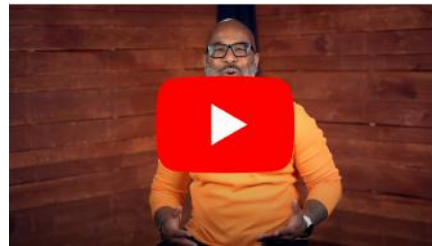
Danny Dollar's Guide to Financial Awesomeness | #2 Entrepreneur