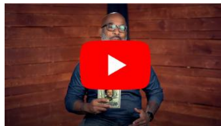
Danny Dollar's Guide to Financial Awesomeness | #4 Spending/Dream Big