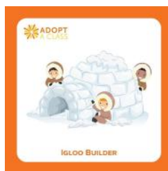
Igloo Builder 3rd - 6th Grade