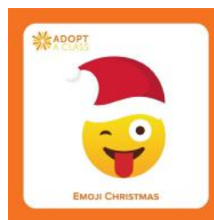
Emoji Christmas 7th - 8th Grade