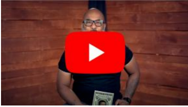
Danny Dollar's Guide to Financial Awesomeness | #3 Saving