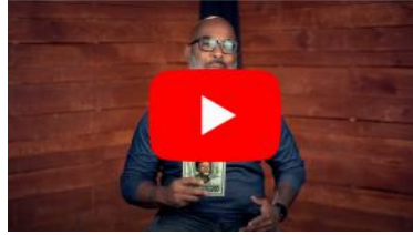
Danny Dollar's Guide to Financial Awesomeness | #4 Spending/Dream Big