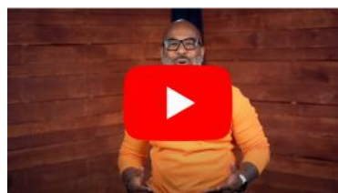
Danny Dollar's Guide to Financial Awesomeness | #2 Entrepreneur