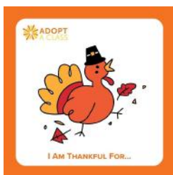
I am Thankful For... PreK - 2nd Grade