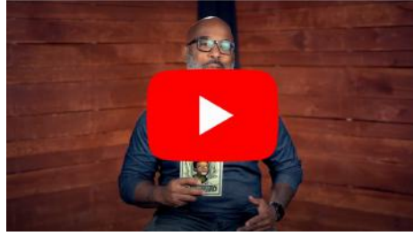
Danny Dollar's Guide to Financial Awesomeness | #4 Spending/Dream Big