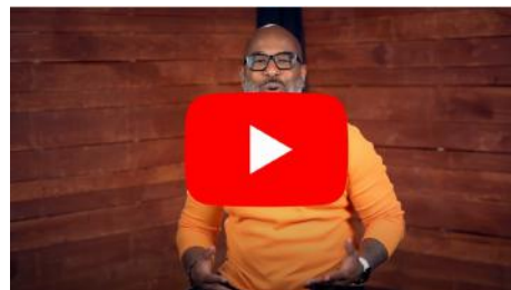
Danny Dollar's Guide to Financial Awesomeness | #2 Entrepreneur