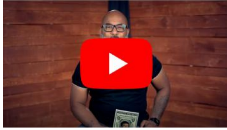
Danny Dollar's Guide to Financial Awesomeness | #3 Saving