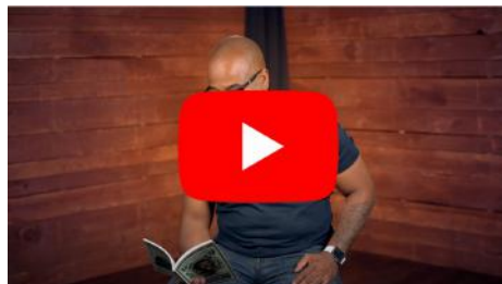
Danny Dollar's Guide to Financial Awesomeness | #1 Intro